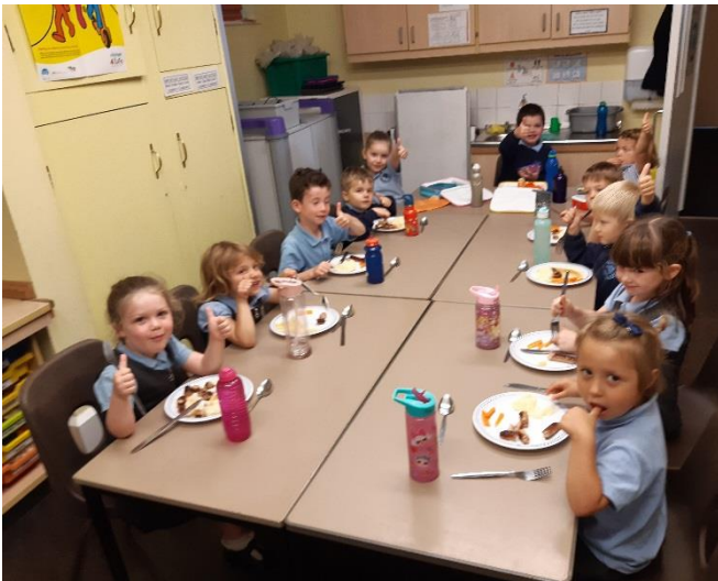
Children in Owl class enjoying their lunch yesterday!