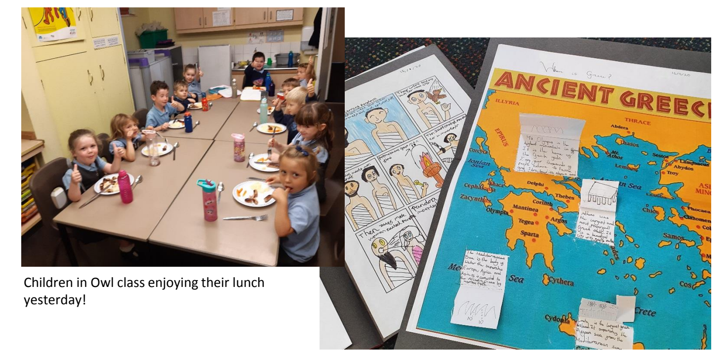
Sparrowhawks have been researching Ancient Greece and retelling the story of Pandora's box.