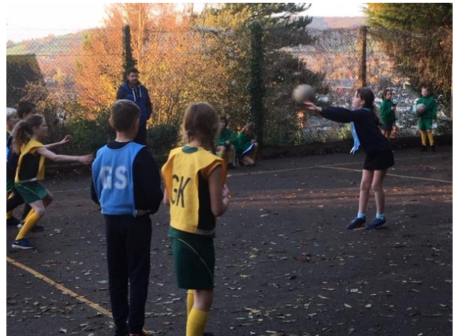
The Randwick netball team at the tournament at Gastrells on Monday