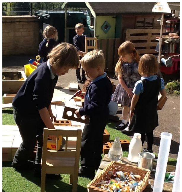
Owls were busy using outside construction to build a stage. They put on a lovely performance and worked really well together.