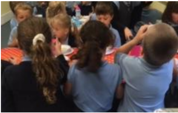
Children were able to try beetroot grown in the school allotment this week.