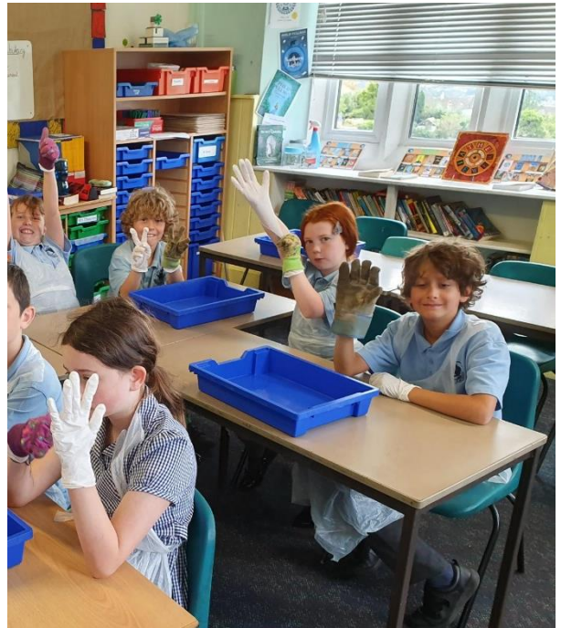
Sparrowhawks studying hearts this week.