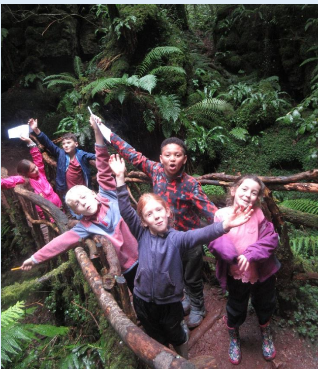
Kestrels had lots of fun at Puzzlewood.