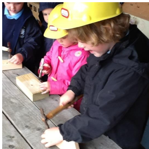
Owl class had fun doing woodwork!