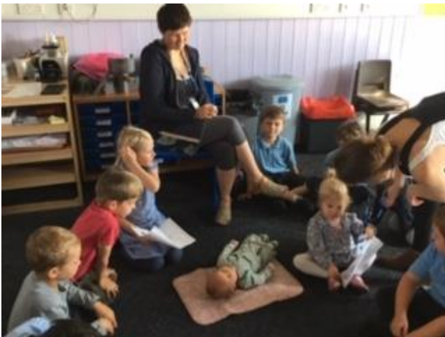
Buzzard class meet a baby, a toddler and a pregnant mum as part of their science topic!