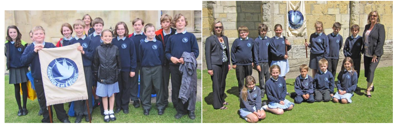
At the Cathedral for the Leavers Service