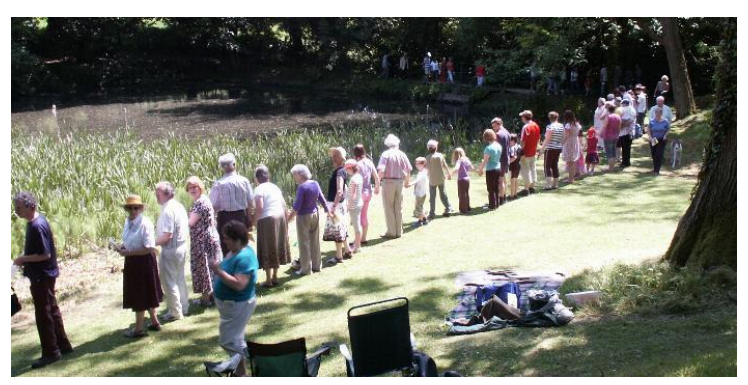
Hands Round the Lake. A Whitsun-tide tradition in Randwick