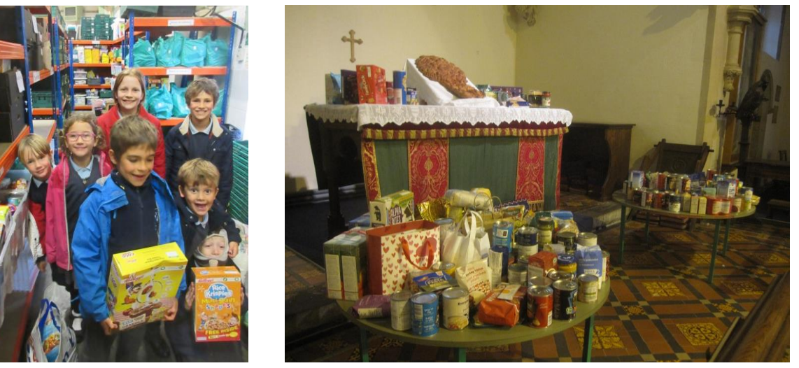
School and Church Harvest Gifts For Marah and the Food Bank

The seven year group reps on the Randwick School Council put their muscles to the test on Tuesday 8<sup>th</sup> November helping to convey all the Harvest gifts to the Food Bank. There they were given a brief tour and armed with a few facts and figures to report back about the 10 tons of goods stored there, and the needs of those who might get a selection of them to provide three days' supply from one of the several distribution centres across the area.