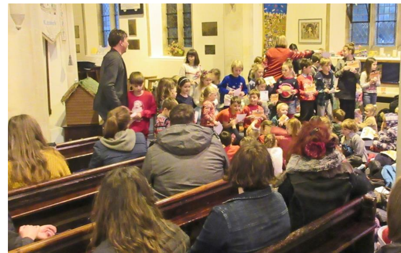
Then faces front, with the others for registration

First up, the many certificates for behaviour, effort, kindness, support, & skill are awarded.