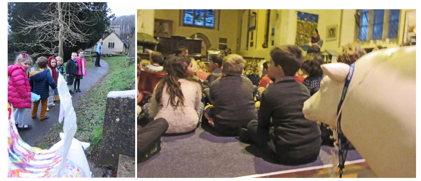
'George' takes a rest half-way