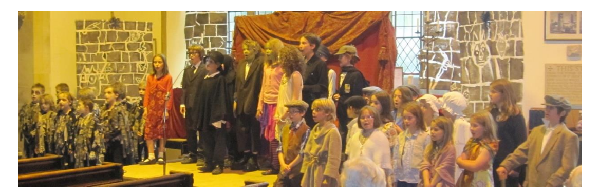
Made in School by Class 2