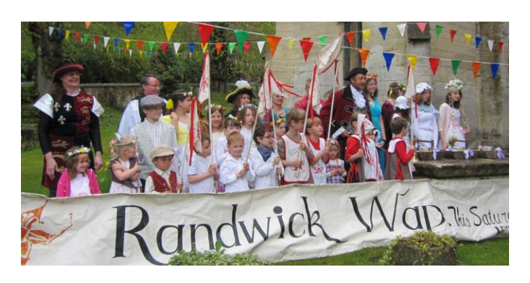
Both at the Randwick Wap in early May