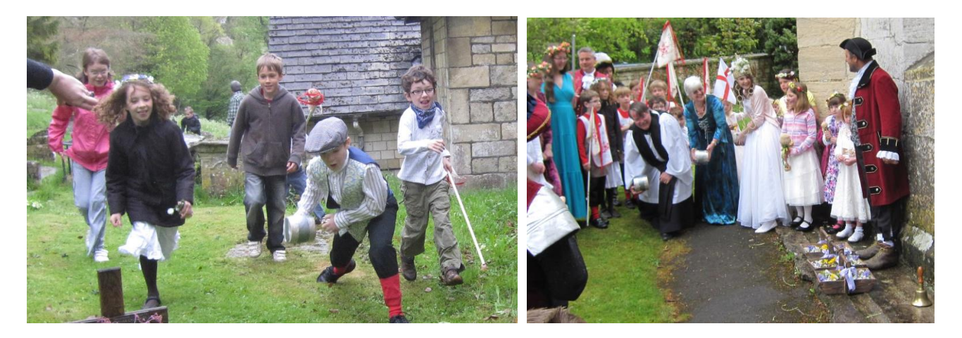
The youngsters continue to play a large part in the annual Springtime Celebrations

The Community links with the School: Mid-August Fun with a Bun, and at Brownies, dedicating the new seat