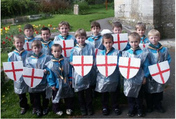
and the St George's Day service in April